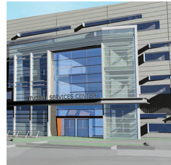
Rendering of new Student Services Center