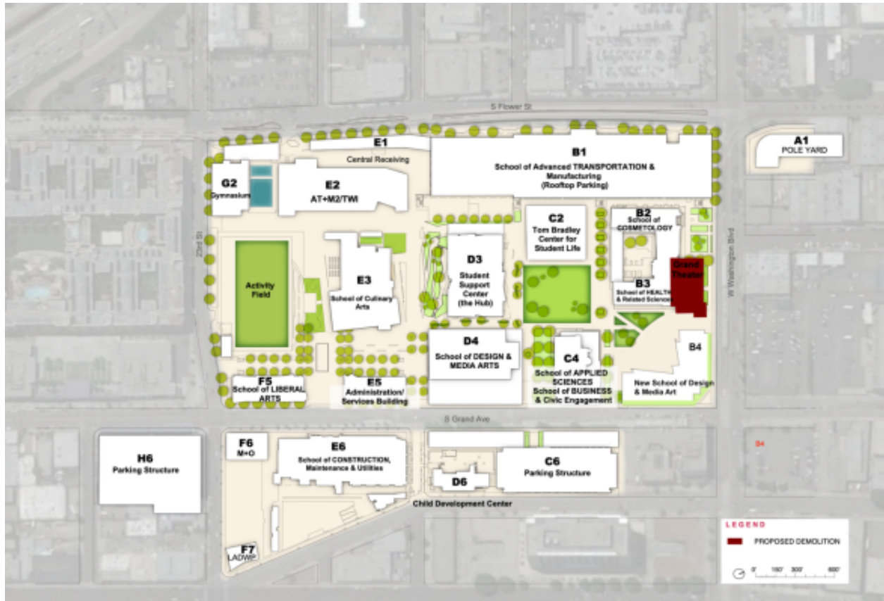
Exhibit 1: Proposed Demolition Location (Depicted in Red)