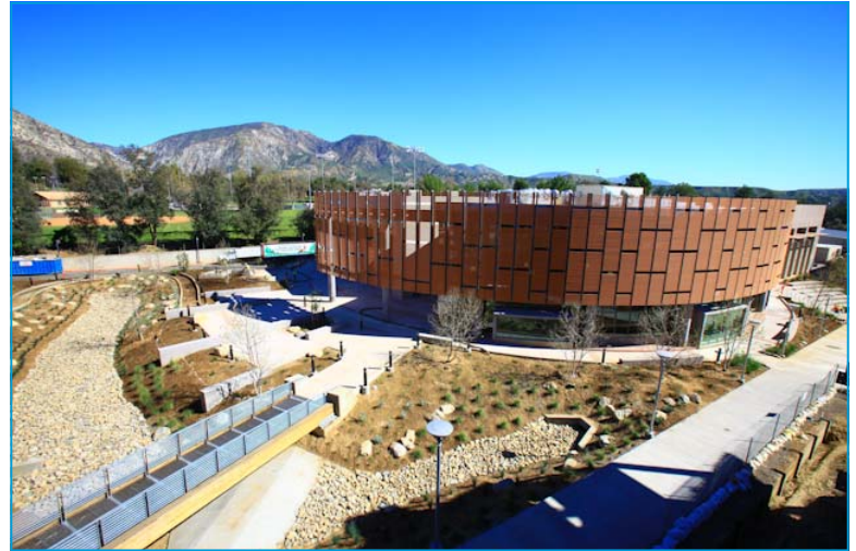
Family and Consumer Studies Building