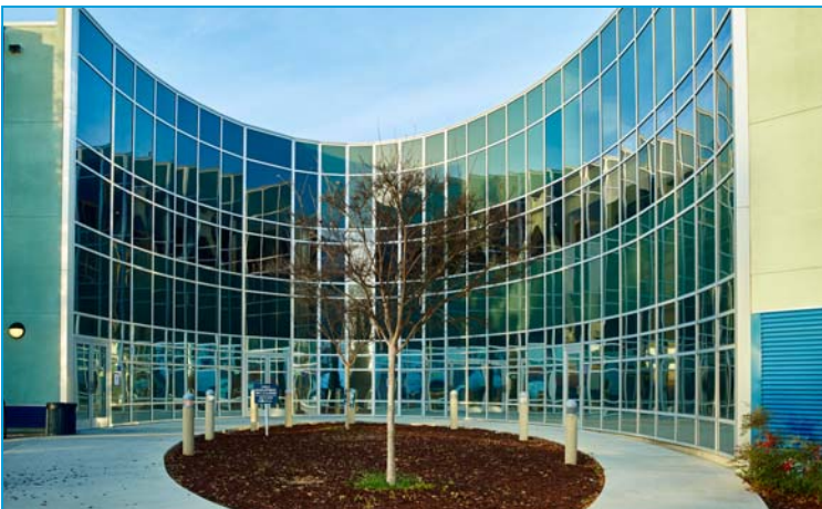
Child Development Center