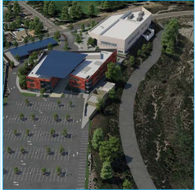
Los Angeles Mission College - East Campus