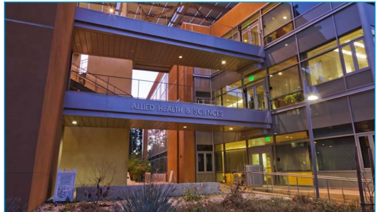
LAVC - Allied Health & Science Center