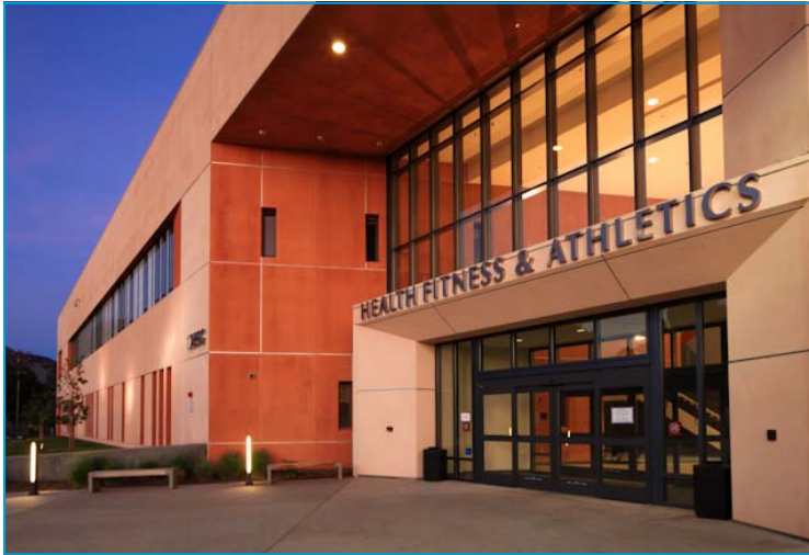
Health and P.E., Fitness Center