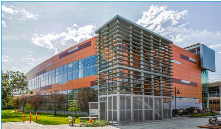
LAHC - Library Resource Center

*Projects may include more than one building.