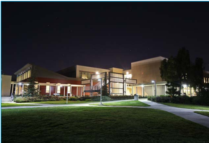
Library and Learning Resource Center