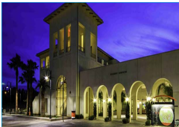
Student Services Building