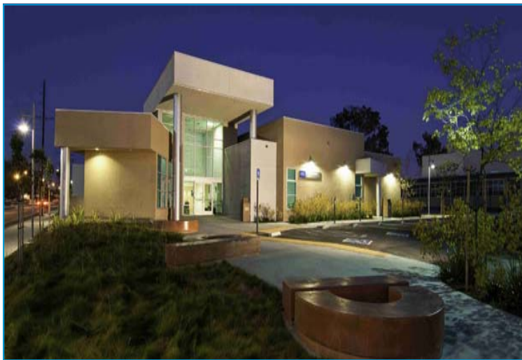
Child Development Center