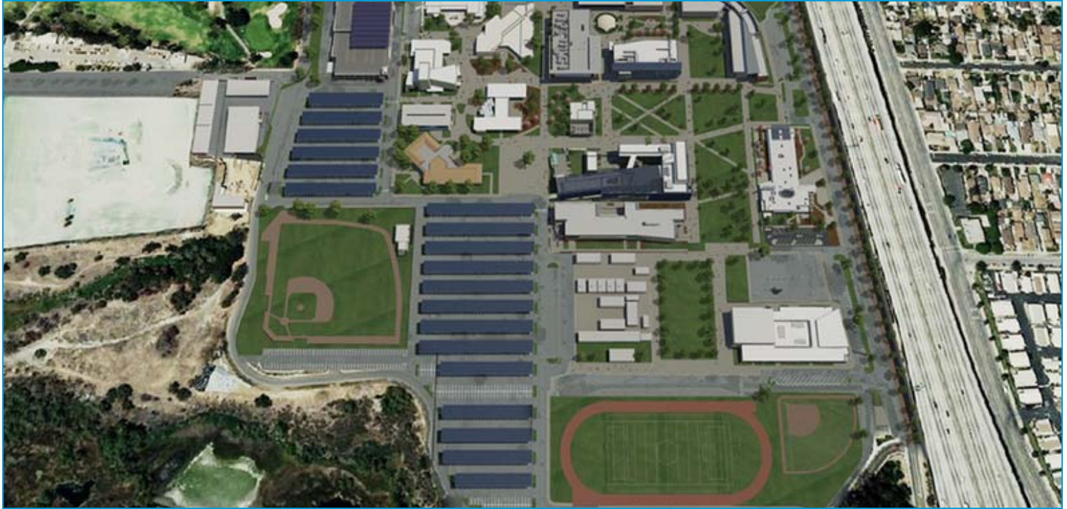
Los Angeles Harbor College

Los Angeles Harbor College has offered educational opportunities for harbor-area residents for over 60 years. The college's student body reflects the cultural and ethnic diversity in the cities it serves: Carson, Harbor City, Gardena, Lomita, San Pedro, Wilmington and the Palos Verdes Peninsula.