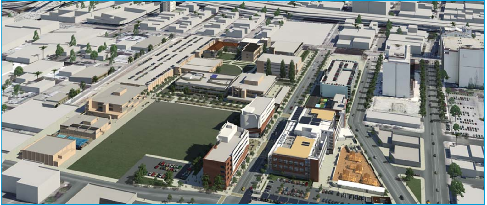
Los Angeles Trade Tech College

Los Angeles Trade-Technical College has educated and trained students for 90 years. Top-rated in construction technology, transportation, culinary arts, fashion design, welding and cosmetology, Trade-Tech has prepared students to transfer to four-year universities worldwide. The 25-acre campus is located in downtown Los Angeles, just south of the central business district.