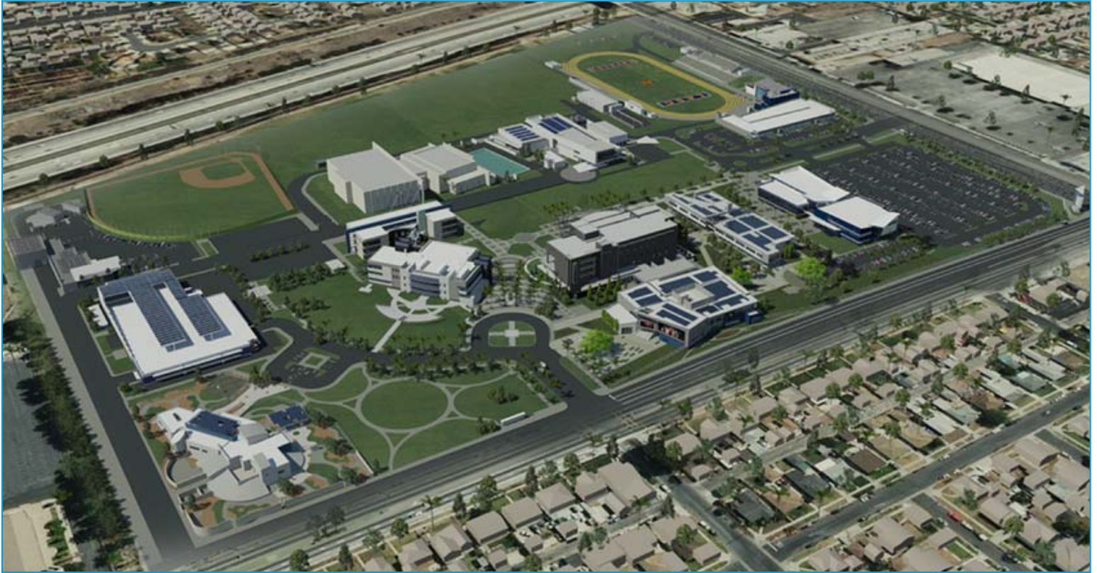
Los Angeles Southwest College

Opened in 1967, Los Angeles Southwest College empowers a diverse student population to achieve their academic and career goals, and to become critical thinkers and socially responsive leaders. LASC offers associate degree programs in 35 fields, occupational certificates in 45 disciplines, community services and ESL/citizenship classes.