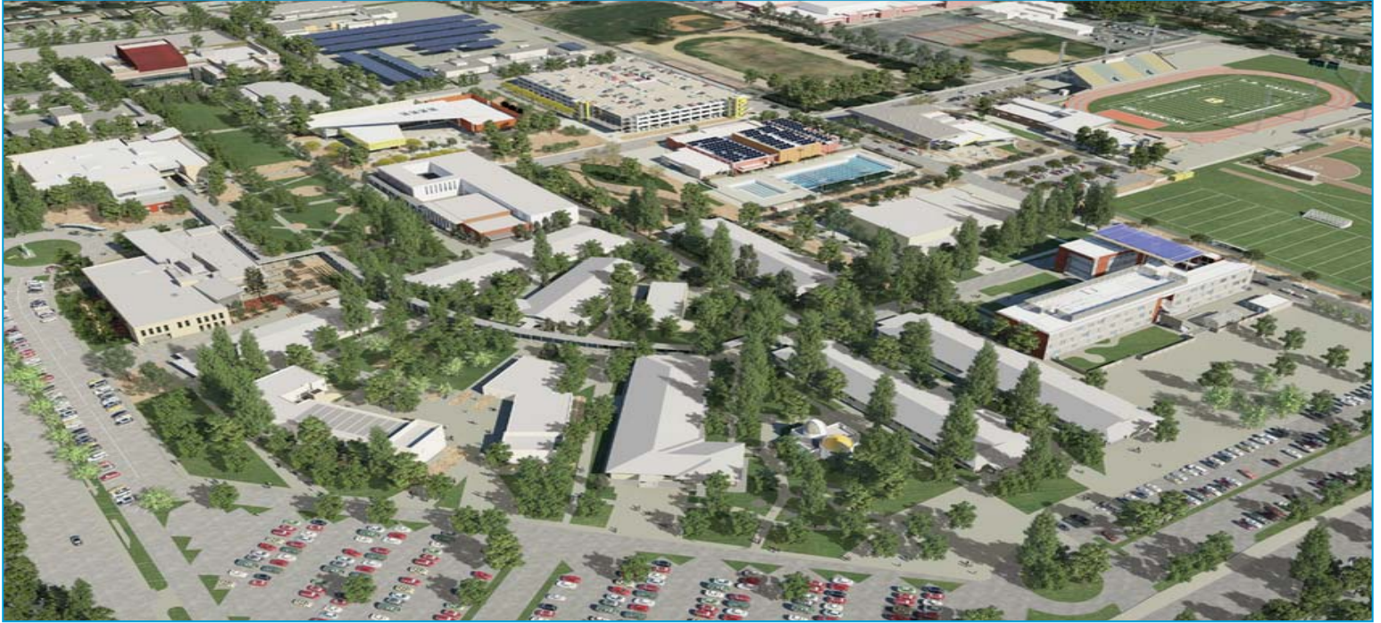
Los Angeles Valley College

Since 1949, Los Angeles Valley College has offered students the education, skills and training necessary to pursue their dreams at the school's Valley Glen campus, located in the eastern San Fernando Valley. Valley College's maintenance and operations building was the first LEED-certified building completed by LACCD's bond-financed build program.