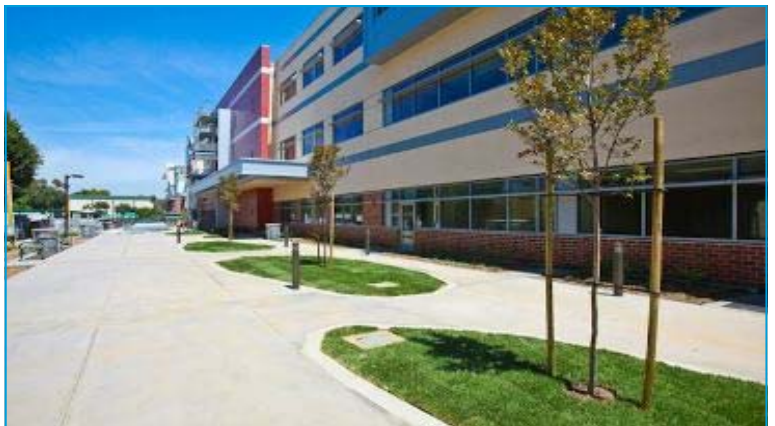
E3 E5 Replacement