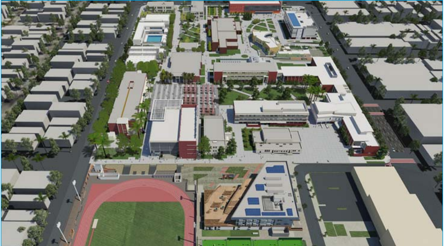
Los Angeles City College

The 78-year-old campus is located on 49 acres in the heart of Los Angeles. The college is enhancing its campus with a new, advanced technology learning facility, increased parking, and expanded athletic/fitness and child development centers. LACC's math and debate teams are nationally recognized and its theater and cinema-television programs are among the best in the country.