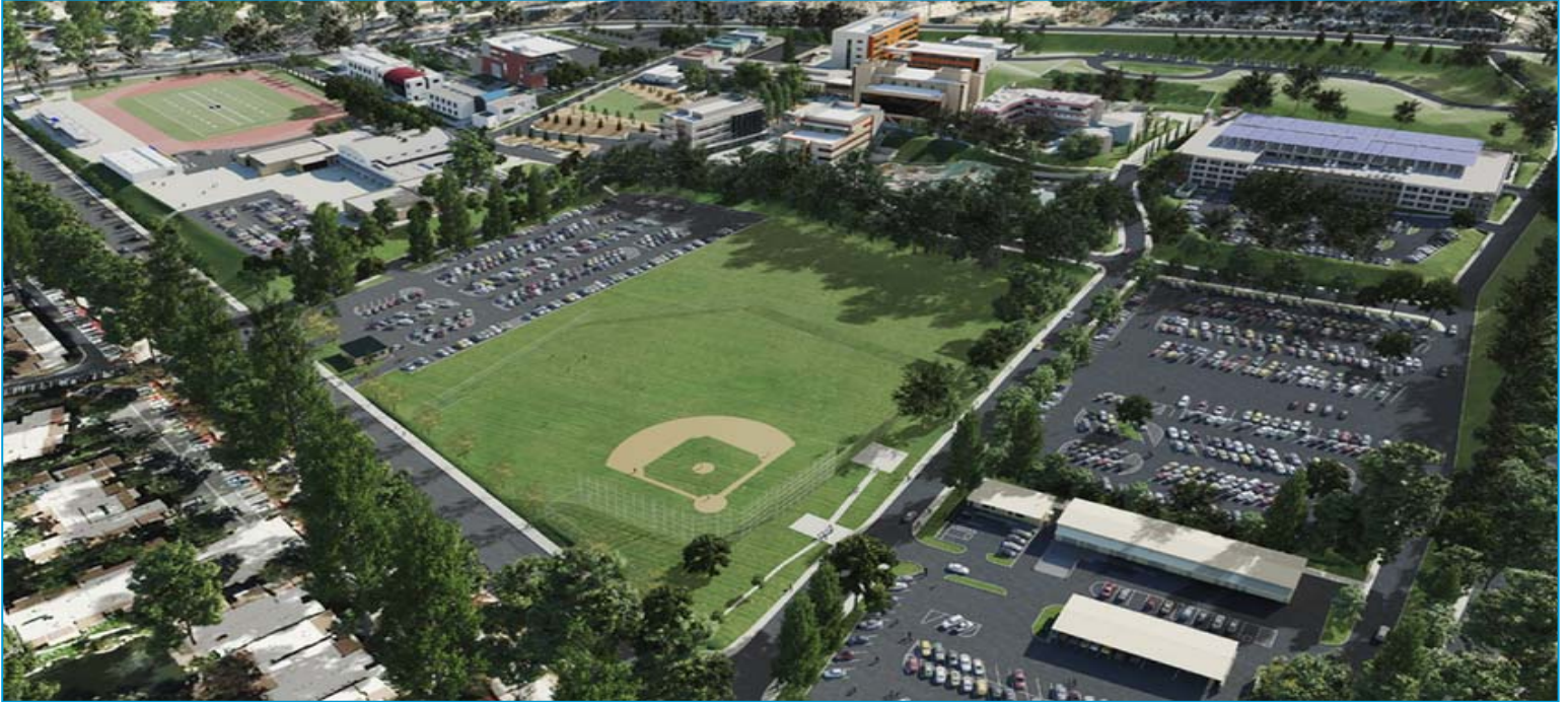
West Los Angeles College

Since it opened in 1969, West Los Angeles College has served thousands of students on its 70-acre campus near Culver City. West awards more than 600 degrees and certificates annually in approximately 50 fields, including STEM areas, computer science, allied health, law and film/tv production, arts, the liberal arts, humanities, and social and behavioral sciences.