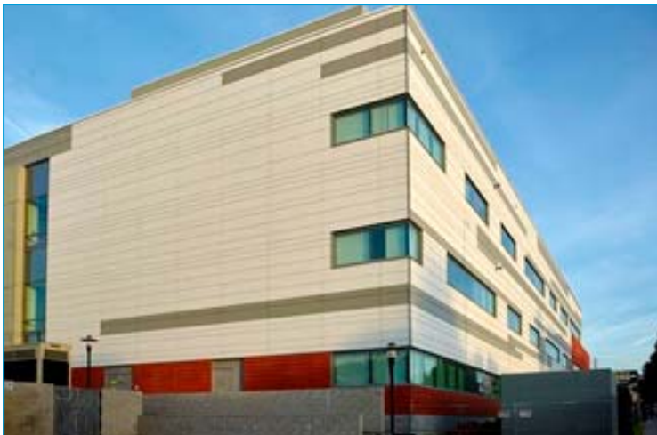
LACC - Science & Technology Building