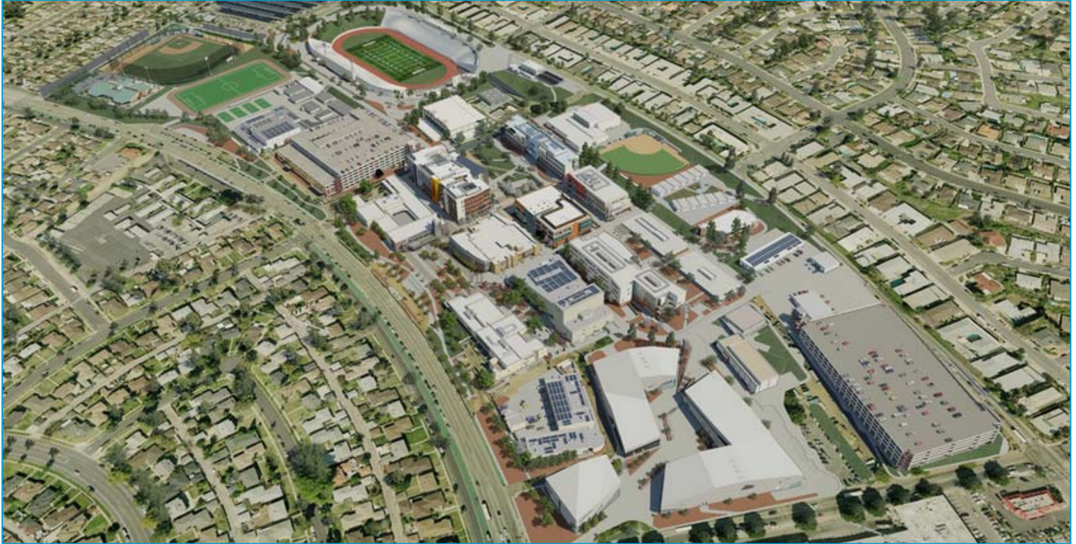
East Los Angeles College

Each year, ELAC helps more than 1,000 of its students transfer to the University of California and California State University systems. Forty-seven percent of its students are focused on transferring to a 4-year school while 18 percent are working toward career preparedness. The college's 80-acre campus is located 10 miles east of downtown Los Angeles in suburban Monterey Park.