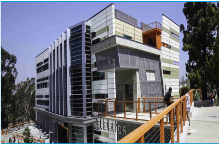
Student Services Building