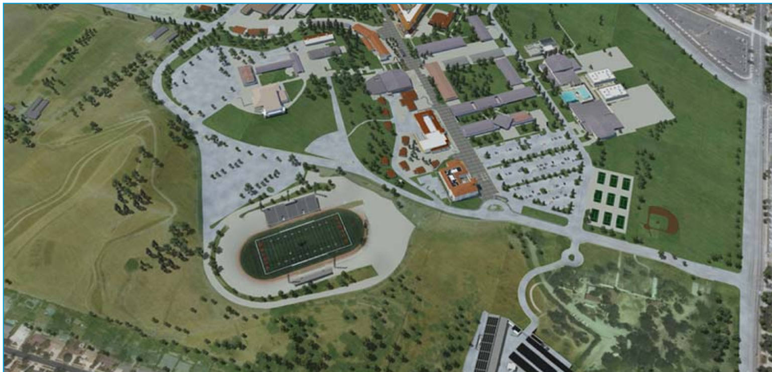
Los Angeles Pierce College

Pierce College sits on 426 acres in the western San Fernando Valley. Each semester about 22,000 students are served in a diverse and dynamic mix of career, technical, transfer, workforce education and general interest programs. The school's comprehensive curriculum includes exceptional science, technology and nursing departments.