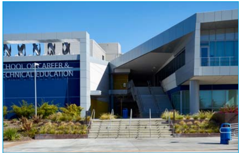
LASC - School of Career & Technical Education