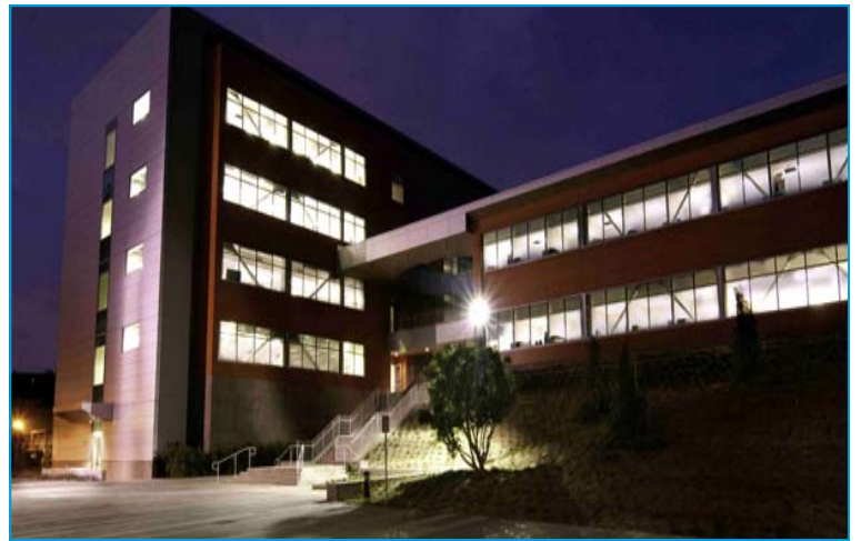
Science and Math Building