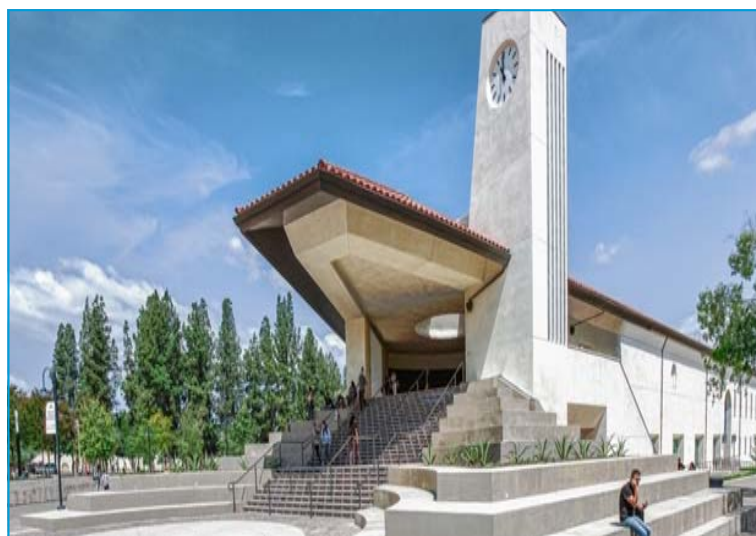
New Library/Learning Crossroads Building