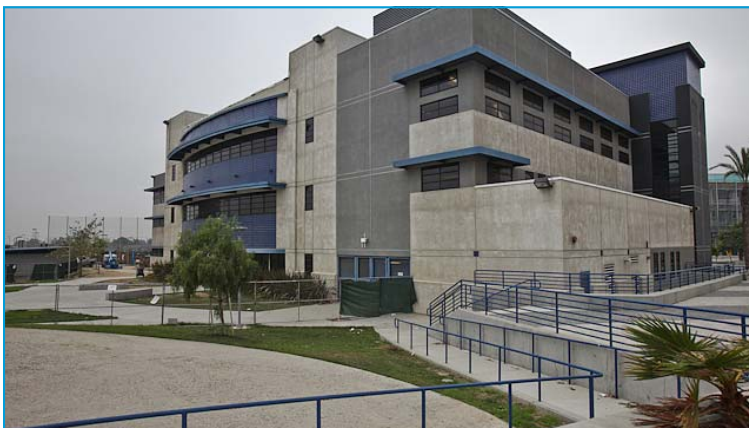
School of Behavioral & Social Sciences