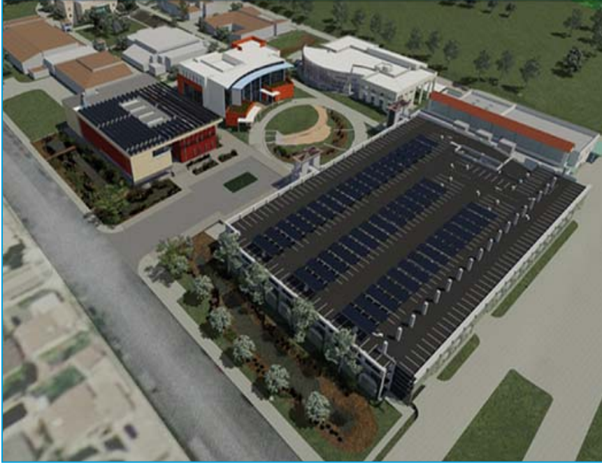
Los Angeles Mission College - Main Campus

Founded in 1975, Los Angeles Mission College is the youngest of LACCD's nine colleges. On its 22-acre campus in Sylmar, Mission College offers accessible, affordable, high-quality educational opportunities in a culturally and intellectually supportive environment.