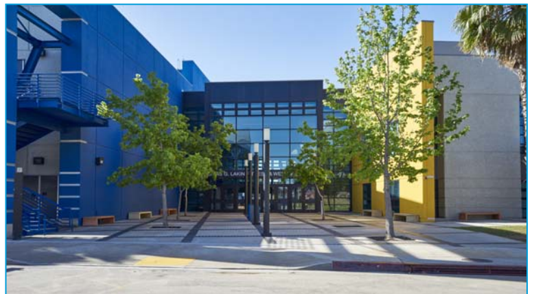
Fitness and Wellness Center