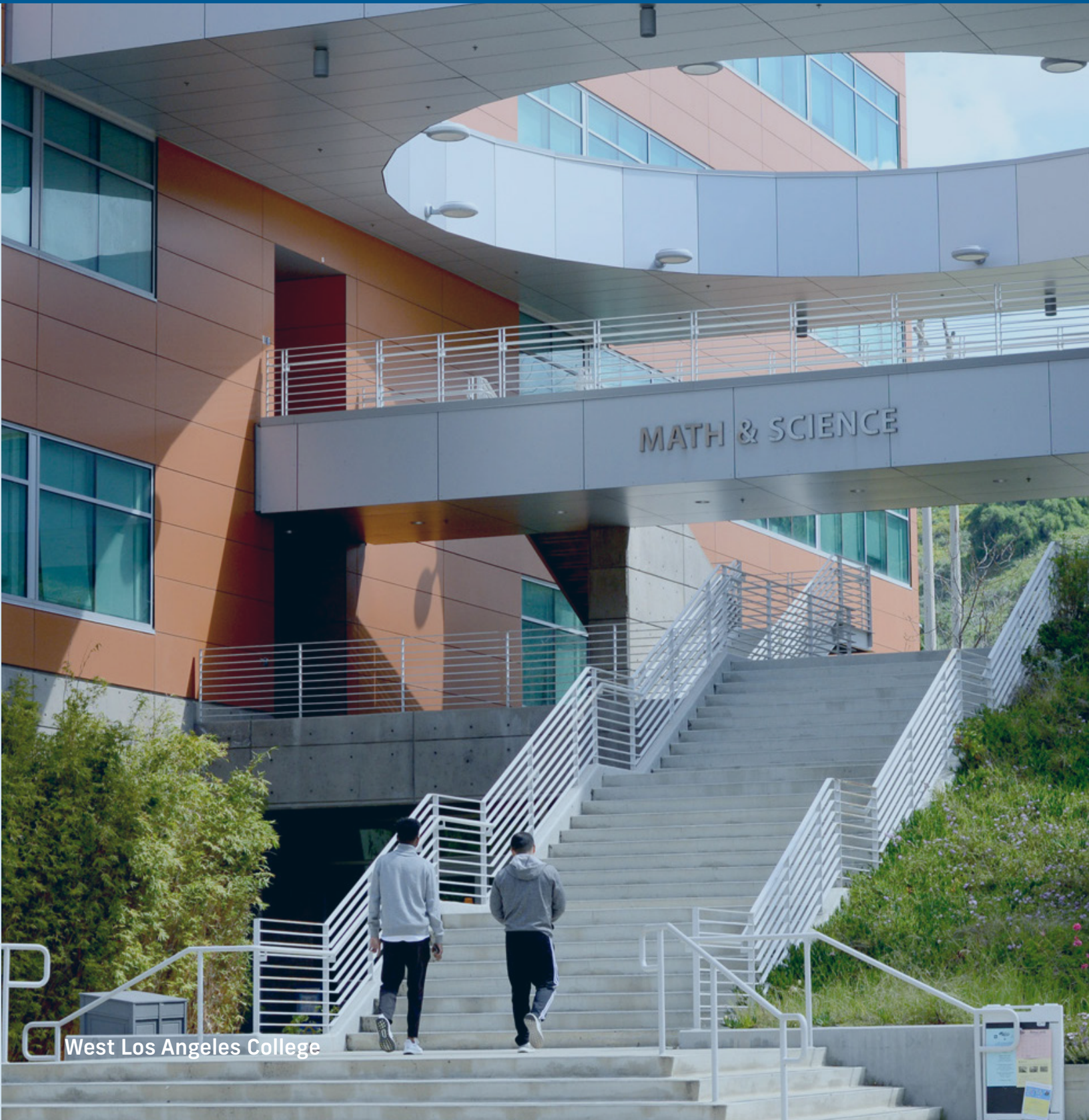
West Los Angeles College